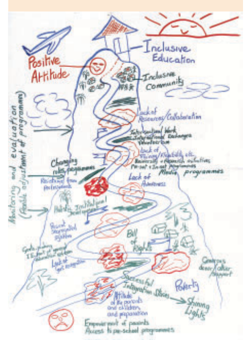
"Successful inclusion depends upon the careful and planned allocation of existing human and material resources."

appropriate policy development; system change in education.