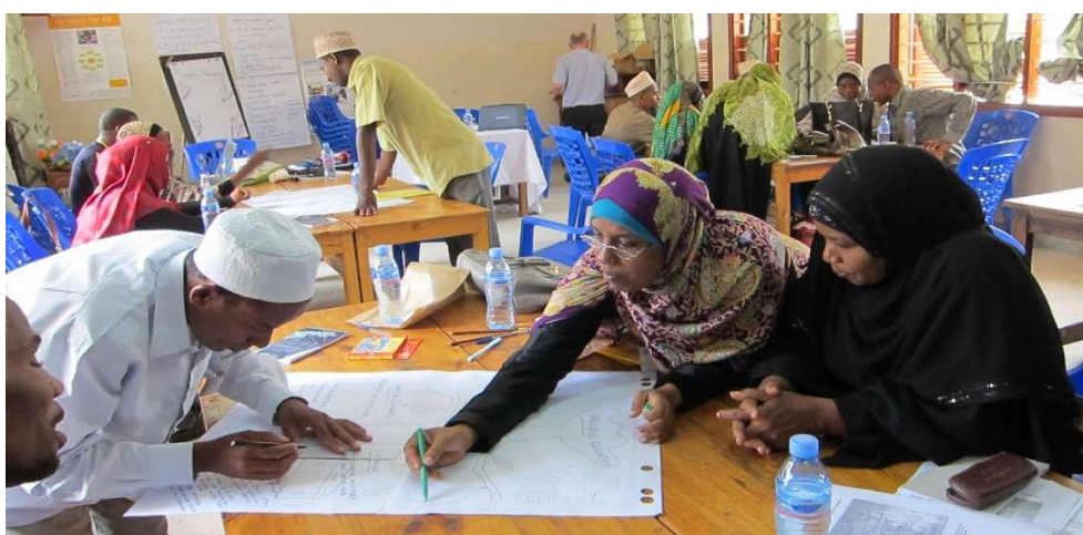
An example of a workshop room set up for group work

The ideal room set-up is to have participants working in small groups around tables, for instance 4-6 participants per table. The tables should be large enough to accommodate flipchart paper and for the groups to work comfortably together, wearing masks and socially distant where Covid-19 safety regulations apply. The tables should be positioned so that everyone can easily move their chairs to see the front of the room or wall where PowerPoints are being projected, whenever necessary. There should be plenty of space between tables to ensure accessibility and ease of movement for trainer and trainees.