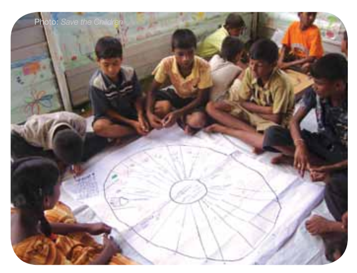
Displaced children in a temporary school supported by Save the Children, Sri Lanka

Child-to-child approaches help teachers to identify learners who are experiencing difficulties. As we will see in Chapter 7, they also help teachers with teaching these learners, especially in large classes where the teacher cannot help every child individually all the time.