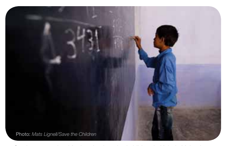
Student at a school for hearing impaired children in Kabul, Afghanistan