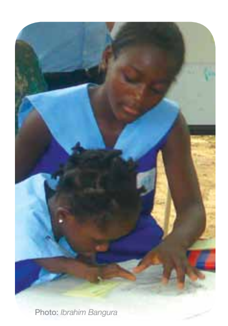
School children helping each other at the SOS Village School, Freetown, Sierra Leone

Teacher trainers or mentors will need to support teachers to help them work out how to introduce a buddying approach in a positive way, and how to keep it going. For example, the arrangement can be explained to the rest of the class by emphasising that everyone can take part in education, and we all need different things to help us learn well. Buddy pairs should not be seated separately from the rest of the class, or isolated from the class.