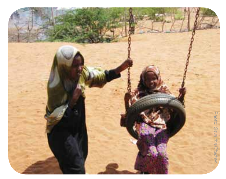
Children playing in a Child Friendly Space, Kenya