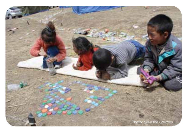
Children making a house image using plastic bottle tops, China