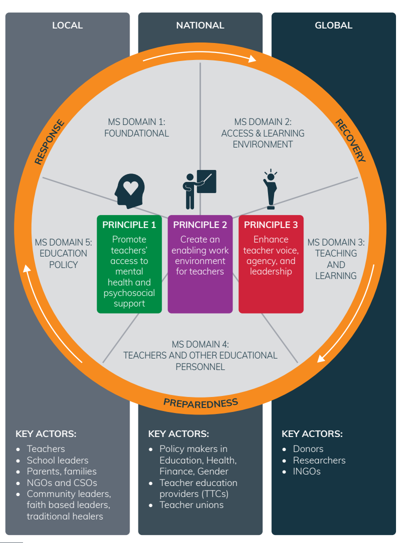
Figure 1. Teacher Wellbeing Guidance Note Organizational Framework

Figure 1 below shows how this Guidance Note is organized. It explains how the Minimum Standards, three Principles of teacher wellbeing (explained below), and the socio-ecological model for teacher wellbeing interact. It also shows how teacher wellbeing depends on context and is connected to the work that humanitarian and development organizations do.<sup>4</sup>