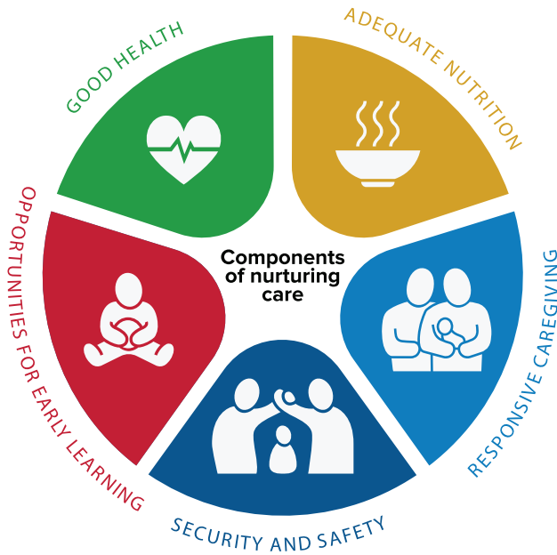
Figure 1. Nurturing Care Components