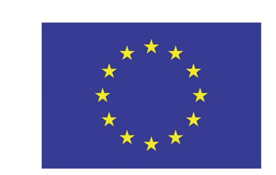
Project funded by the European Union