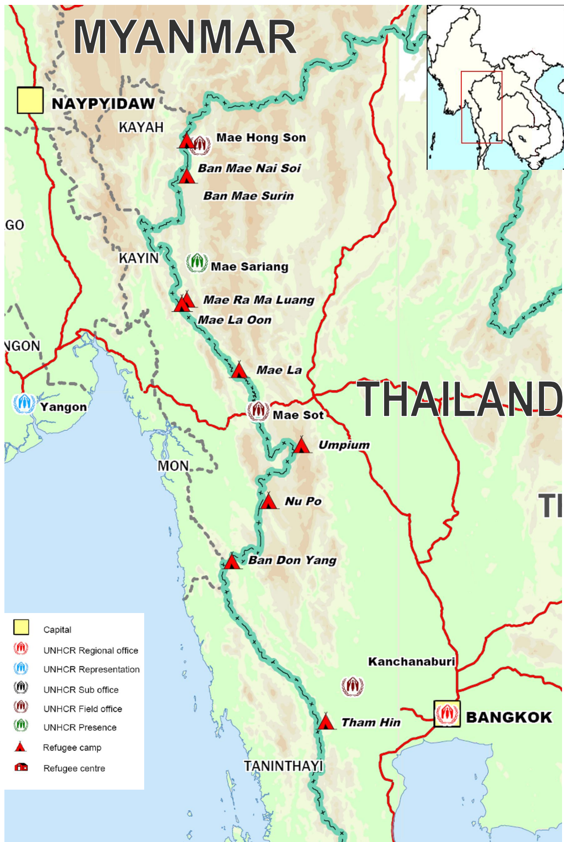
Map 1: Thai-Burmese Border with nine Refugee Camps