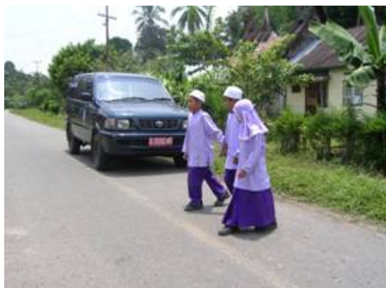
Photo by Indonesian primary school students of the road outside of their school

Dangerous road crossings and dangerous drivers are also very real threats to student safety. The students who took the photograph below explained to us that the road they must cross to get to school is very dangerous and that motor vehicles (often driven by people from outside the community) drive very fast in front of the school, without care for the safety of students.