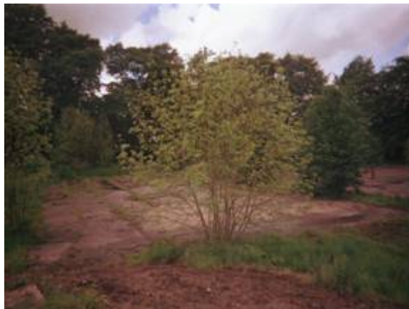
Photo by UK secondary school students of damaged and overgrown play area