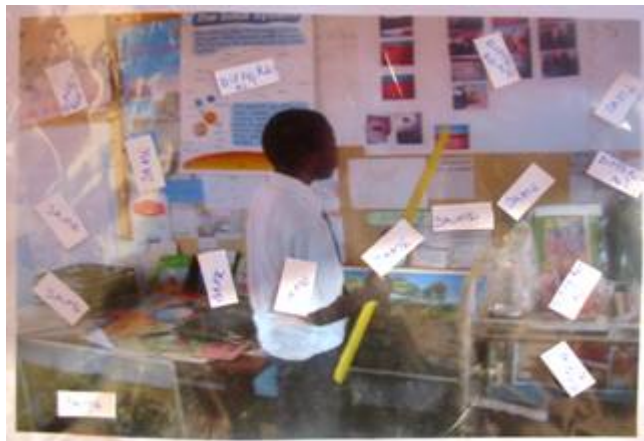
An example of a photograph used for the ‘spot the difference’ activity

This activity involves placing students into small groups and giving each group photographs taken by students in different schools. The groups are then asked to ‘spot the difference’ between the school in the photograph(s) and their school. It has been useful to give students small stickers on which they can write ‘same’ or ‘different’ to place as markers on the photographs (which can be protected in clear plastic folders or laminated). This activity can stimulate students to think about the photographs, and the schools they depict and then compare them to their own situations. As well as stimulating critical thinking about what is visible (and what is not visible) in photographs, this activity can prime students to consider what they might photograph in their own schools. It is worth remembering that there are no ‘right’ or ‘wrong’ answers and that it may be helpful for an adult to help facilitate discussion.