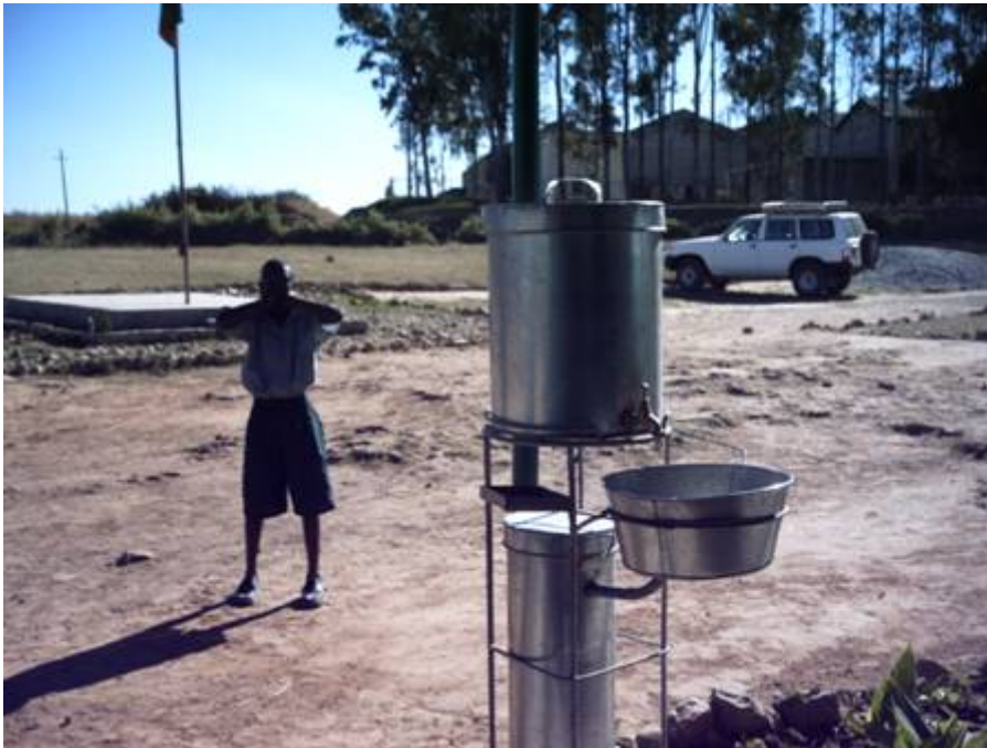
Photo taken by students in Zambian primary school of school's clean water dispenser

The importance of having a clean and ample supply of water was an issue raised by many students.