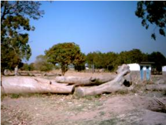
Photo by Zambian primary school students of logs from a fallen tree in school playground