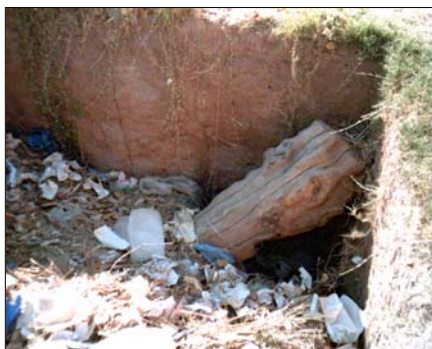
Rubbish pit - September 2004

'No matter how you see it to be very small, for us it's big. Last time (when the children took their photographs) I was not around but I found the photos when I returned. I was more interested in the bad pictures because for me it showed the children were able to see where we were lacking, where we need to put more emphasis and resources. For example we had a very big ditch...it was very big and very dangerous to our children, so they picked it up. For us we treated it as a rubbish pit, but for them, it was dangerous that pupils were going to fall in. So, when it appeared on the bad pictures, we moved it and buried it. So we believe whatever the pupils will treat as bad pictures we are going to make up for it and try what we can do, despite the limited resources. We are trying to encourage child participation and for us, as a school, that's one way of child participation.'