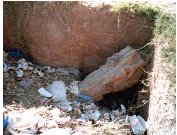
Photo by Zambian primary school students of open rubbish pit on school grounds