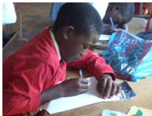
Zambian primary school students writing about their photographs

We have found that students, even those who usually struggle with writing, are often able to write detailed and creative accounts of their photographs. Some of the richest feedback we have received from students about their educational experiences has come in the form of their writings about their photographs. It may be useful to encourage students to think and write about their photographs before they discuss them. Moving too quickly from taking photographs to discussing them only encourages simplistic interpretations and can be a barrier to in-depth discussion.