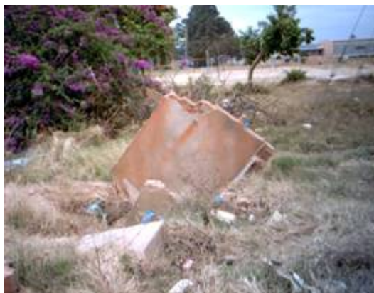
Photo taken by students of collapsed toilet in a Zambian primary school