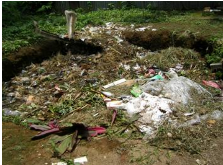
Photo of open rubbish pit on school grounds taken by Indonesian primary school students

Litter on school grounds and open rubbish pits are fundamental concerns for students in many schools. This issue of litter was highlighted by students in almost every school we have visited in Indonesia, Zambia and the UK.