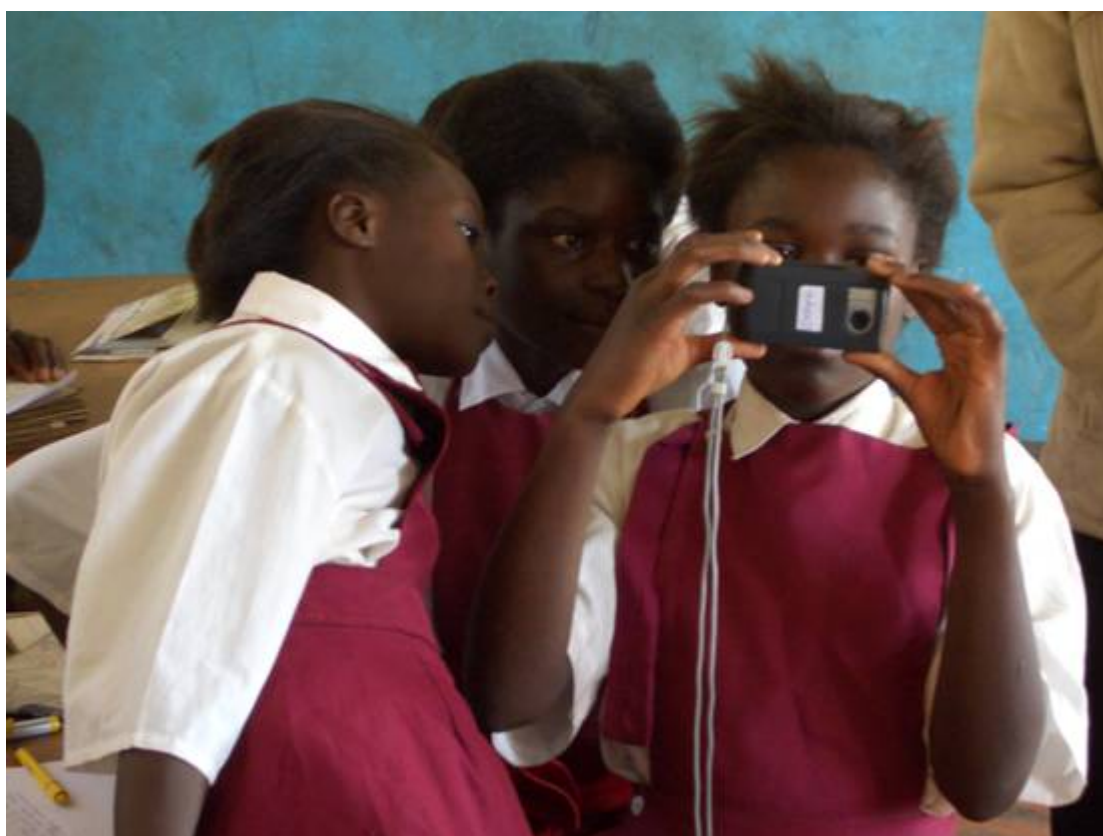
Zambian primary school students experimenting with a digital camera

Using photography to address issues of health and safety in Indonesian, UK and Zambian schools