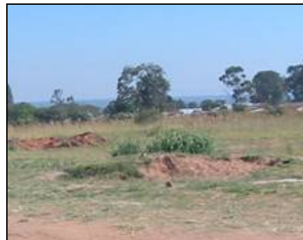
Rubbish pit - May 2005