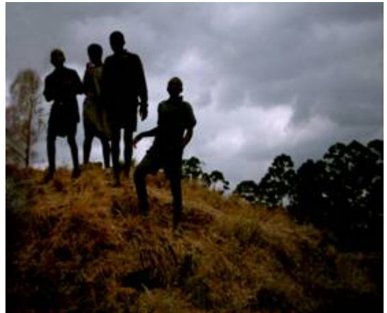
Photo by Zambian primary school students of students playing on snake-infested hill next to school