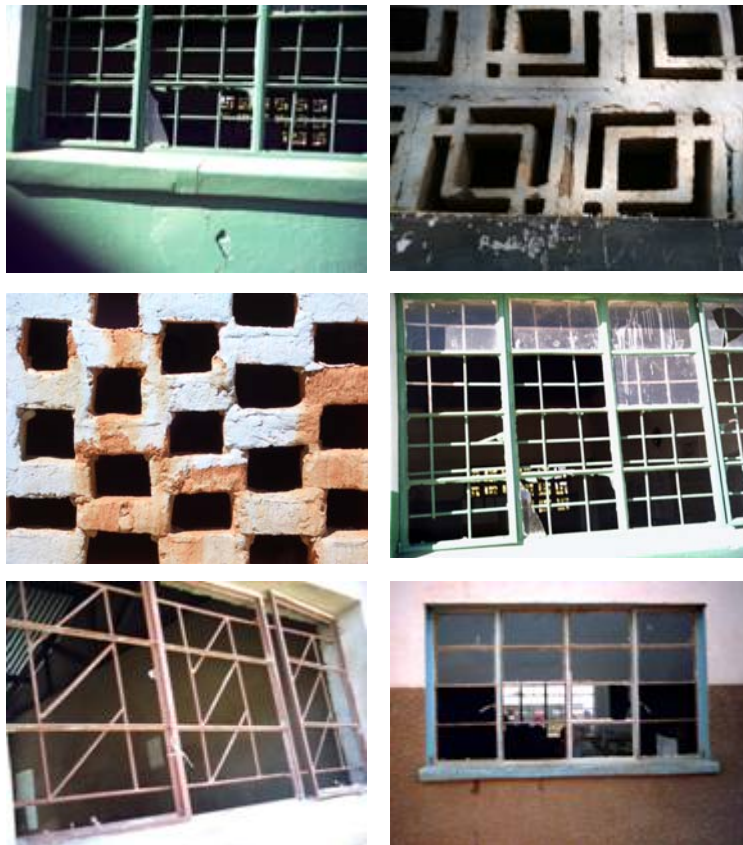
These photographs of Zambian primary school windows were all taken by students

Many students we worked with in both UK and Zambian schools took photographs of windows. When asked to explain why they had focused on windows, students raised a variety of issues: