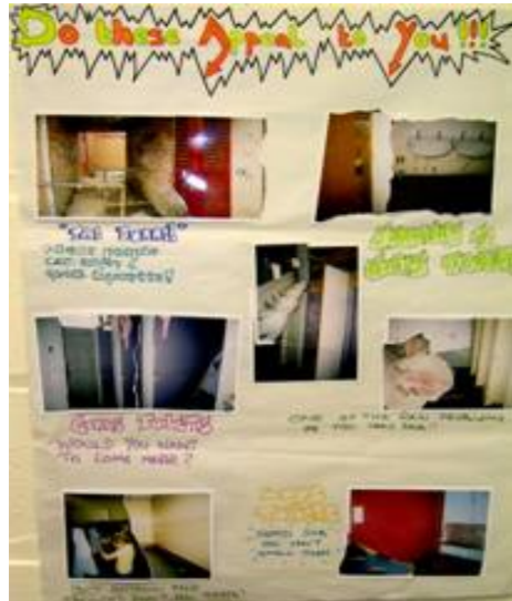
An example of a display created by students in a UK secondary school

into displays, and so some facilitation from adults can be helpful. Students should be encouraged to be creative in their approach to their displays without too much prescription from adults. Skilled and subtle facilitation is important and students should be encouraged to listen to one another and work together as democratically as possible.