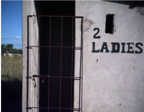
Photo of locked toilet door taken by students in Zambian primary school

Toilets for students in some schools we visited were broken and in various states of disrepair if not completely fallen down. Students pointed out that many toilets lack doors, an issue of safety and privacy. Some toilets also lack roofs, and hence students have no protection from the rain. Some of the toilets that do have doors are often locked and in many cases it is difficult for students to get the keys.