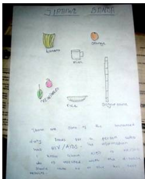
Photo of drawing by Zambian primary school student showing healthy foods that should be eaten by people infected with HIV/AIDS

Although we did not specifically use photography with students to discuss HIV/AIDS related issues, we encountered schools, such as the one shown in the above photograph, where students were exploring these issues through their own drawings, stories and drama.