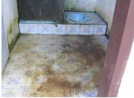
Photo taken by Indonesian secondary school students of school toilets

Students were concerned that the stagnant water in unflushed toilets provides a breeding ground for bacteria and mosquitoes. Students also commented on the general poor state of cleanliness of school toilets and the smell which they said can get so bad it distracts them from their lessons. Because the toilets are often unclean and unsafe, many students try to avoid using the school toilets preferring to wait and use toilets outside of school.