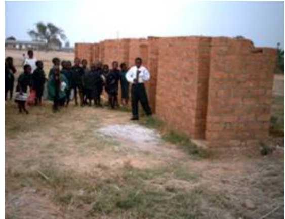
Photo of toilets without doors taken by students in Zambian primary school