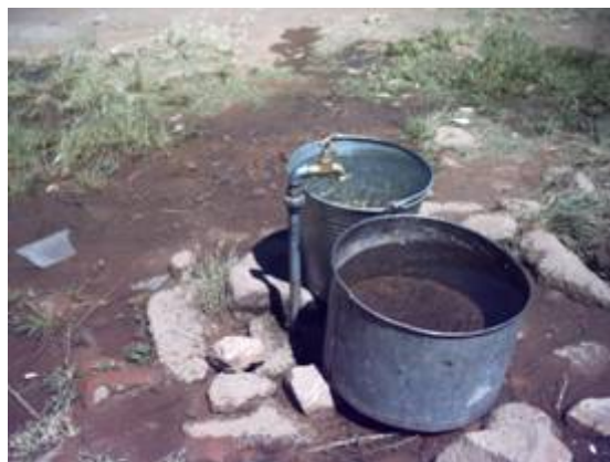
Photo taken by students in Zambian primary school of school's water supply

The students who took the above photograph explained that they are proud of the clean water system in place in their school. Many schools we visited do have access to clean and plentiful water, but some schools have poor access to clean water. In these schools students often have little or no water during the school day, which affects their health and ability to concentrate and learn.