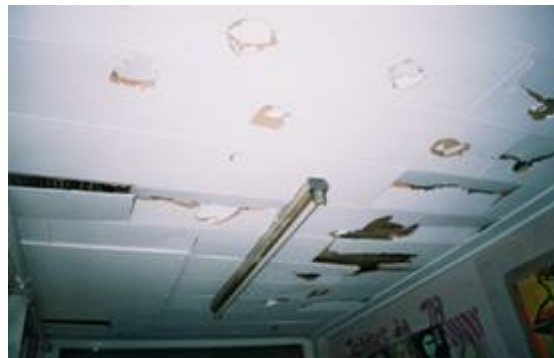
Photo by UK secondary school students of damaged school ceiling

In many schools, buildings and classrooms are marred by vandalism and disrepair. The students who took the photograph below explained: 'Ceiling...Mind your head! One of the main problems as you can see.'