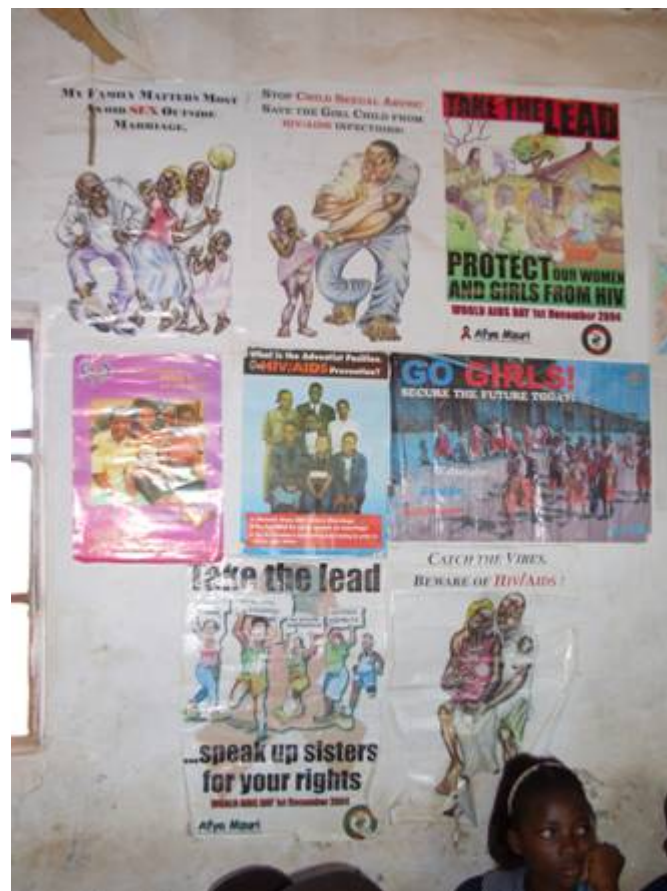
Photo of HIV/AIDS prevention posters on the wall of a Zambian primary school classroom

Regardless of whether students make their own images on the subject, they are often surrounded by images related to HIV/AIDS, its effects, treatment and prevention. These images send sometimes mixed or contradictory messages and it is important for students to be encouraged to think critically about the images they are exposed to in and outside of educational contexts. In some schools, such as the one depicted in the photograph below, students are surrounded by HIV/AIDS imagery even in classrooms.