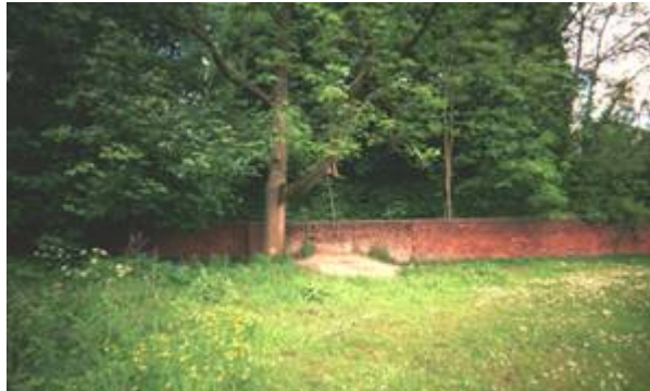
Photo by UK secondary school students of overgrown area where students congregate on the border of the school grounds

In many schools students are at risk from outsiders who come on to school grounds. Overgrown areas and areas bordering school grounds are often cited by students as being places in which they feel unsafe. Despite, or because, these areas can be dangerous some students find these places attractive, particularly as they are often unmonitored by school staff.