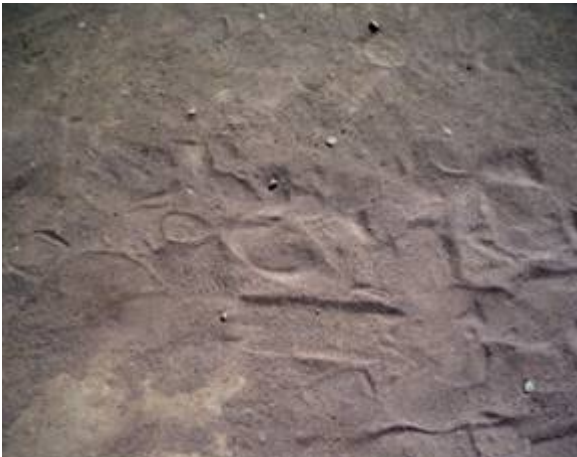
of loose sand on school grounds