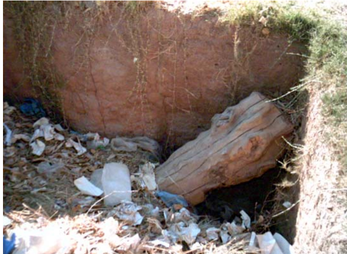
Photo of open rubbish pit on school grounds

Aside from being potentially dangerous, open rubbish pits are unappealing, particularly when they are located at the front of schools, in plain view of students, staff and visitors.