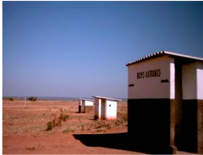
Photo taken by Zambian primary school students

Probably the most universally photographed places with the most negative associations for students in schools we visited were toilets. This was true of schools in Indonesia, the UK and Zambia. Issues of sanitation and personal safety were raised by many students in relation to toilets.