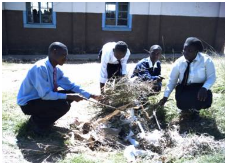
Photo of rubbish pit on school grounds taken by Zambian primary school students

Hazards related to rubbish pits were brought to our attention by students in Zambia and Indonesia, where pits are commonly used for disposal of waste.