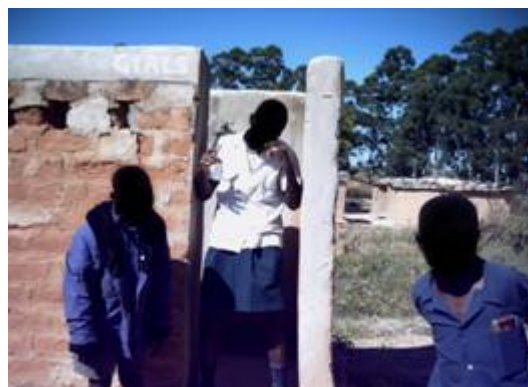
Photo taken by students of boys posing aggressively in front of girls' toilet in Zambian primary school # (see note on following page)