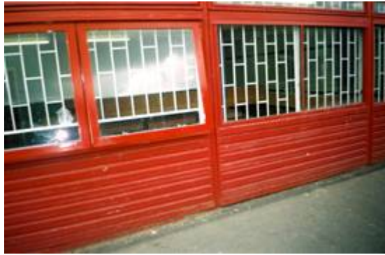
Photo taken by students of UK secondary school windows

The reality of having to secure school buildings and property from theft and vandalism is not always reconcilable with the creation of open and stimulating educational environments. Describing the above photo a UK secondary school student said: 'The bars on the windows are to keep people from stealing things from out of the classrooms, but it's not a comfortable environment to work in...it's not something you'd have at home.'