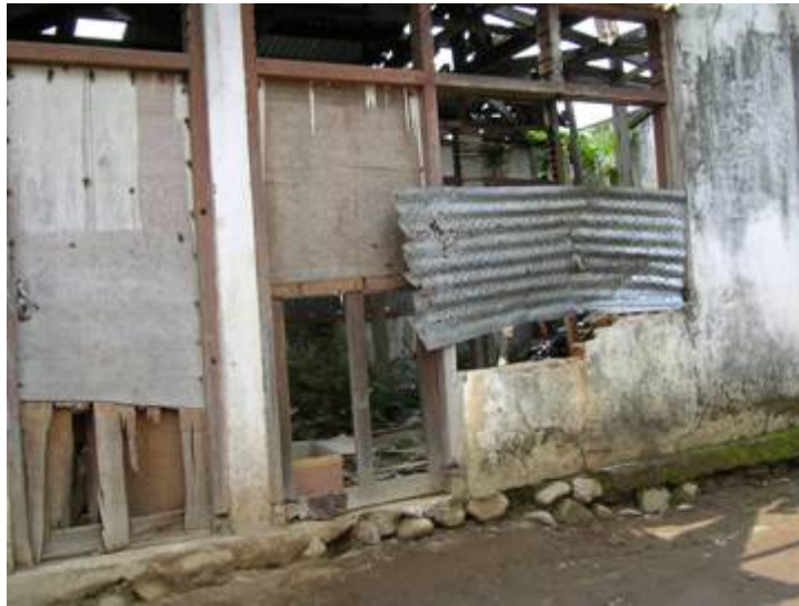
Photo of derelict building on school grounds taken by Indonesian primary school students

The students who took the above photograph said: 'This house has fallen apart. It is ugly and dangerous. Children play in there and can get hurt. There is rubbish inside.'