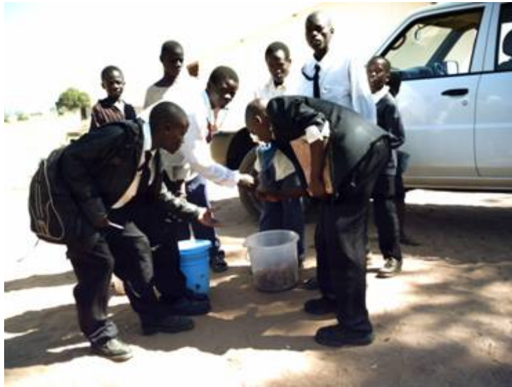
of unclean food sold on school grounds

Food safety was an issue raised by students in some schools.