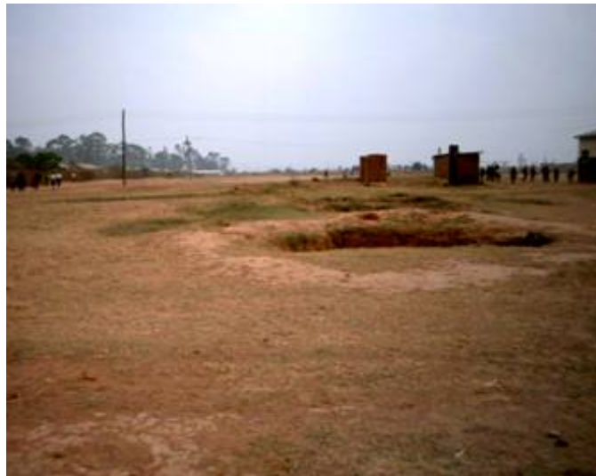
Photo of open rubbish pit on school grounds taken by Zambian primary school students

Students generally shied away from simplistic answers to the problems posed by open rubbish pits in schools. None of the students we spoke with suggested that it would be possible to get rid of rubbish pits altogether. The students who took the photograph below explained: '(A rubbish) pit at school is important. But the way we keep it is not the way you have to keep it. That is the badness.'