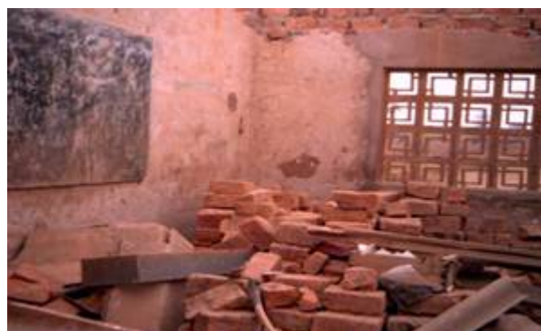
Photo by Zambian primary school students of disused classroom full of bricks and rubbish

Many schools we visited had partially collapsed and derelict buildings and classrooms. It was explained to us that some students injure themselves in these areas and that having damaged and unused buildings on school grounds distracts students from their learning. The presence of these unused (if not unusable) buildings and classrooms is difficult for students to understand, particularly in schools where classroom space is insufficient.