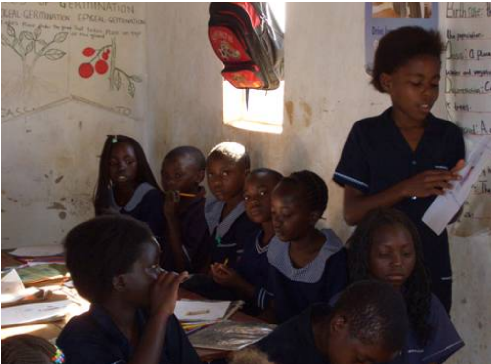
Photo of Zambian primary school student sharing her drawing about HIV/AIDS with her class

Although we did not specifically use photography with students to discuss HIV/AIDS related issues, we encountered schools, such as the one shown in the above photograph, where students were exploring these issues through their own drawings, stories and drama.