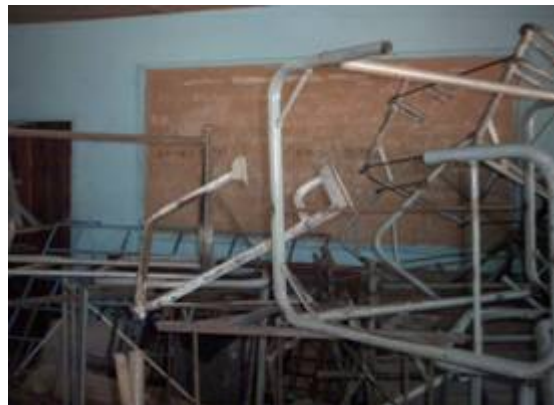
Photo by Zambian primary school students of broken desks stored in library

In some cases, classrooms which are still used for teaching and learning also double as dumps or stores for damaged furniture. The students who took the above photograph of the school library explained: 'We have no books in here anymore, it's become a place to put broken desks.'