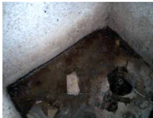
Photo taken by students of dirty toilet in a Zambian primary school

The students who took the above photo explained: 'The toilets are bad... people 'miss' the hole! The toilets are not clean enough, we could get cholera or dysentery in the rainy season. This toilet has no door...there is nothing to keep the flies away. But the toilets for the staff look better.'