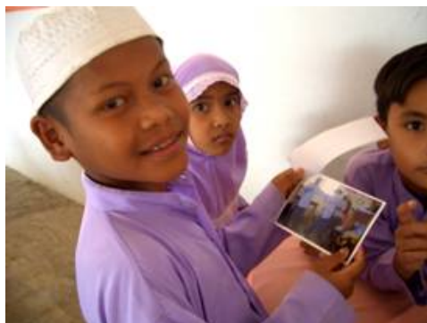
Indonesian primary school students examining their photographs

Prints of the images have either been produced professionally and returned to the students, or printed on portable printers on location. In order to provide some structure to the activity, we have given students a loose set of guidelines on what to photograph, including: things they like or dislike about school; welcoming or unwelcoming places; and comfortable and uncomfortable places.