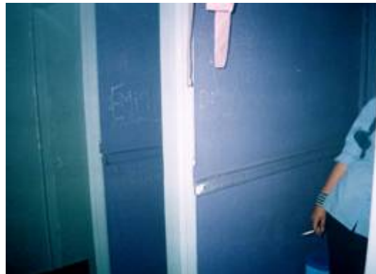
Photo taken by students of vandalised toilets and student smoking in a UK secondary school

Students recognize threats to safety from both outside and inside of the school community. Students were concerned that people from outside their schools use school toilets and sometimes attack students in or near the toilets. Again, female students are particularly vulnerable to rape and other forms of violence in school toilets. Many students were also concerned about violence, bullying and vandalism in toilets from students and staff within their school communities.