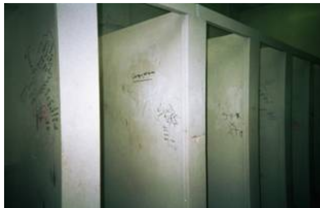
Photo of toilets without doors taken by students in UK secondary school