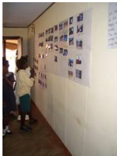
An exhibition of Zambian students' participatory photography projects

Exhibitions of the students' photographs and commentary can be set up in or outside of the school in order to engage other members of the school community such as other students, parents and school staff. The students' work can be used as a point of discussion between different groups of stakeholders in the school community (and beyond), although like other activities this will benefit from skilled facilitation.