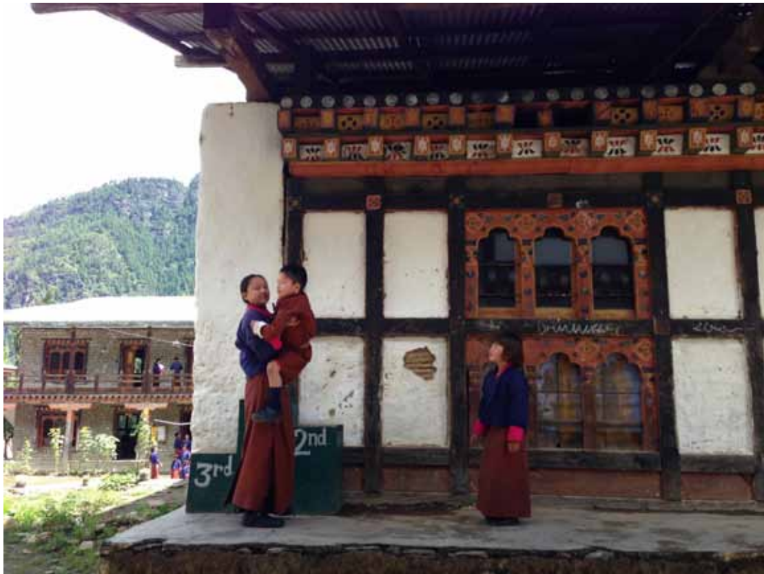
The façade of the Drugkyel Lower Secondary School in Paro, Bhutan which is considered as a model school for special education needs.

In future, the MoE is interested in working more closely with the Ministry of Labour and Human Resources (e.g. in relation to providing enough well trained teachers to support inclusion). This is essential and it is recommended that such collaborative work be developed further with support from UNICEF.