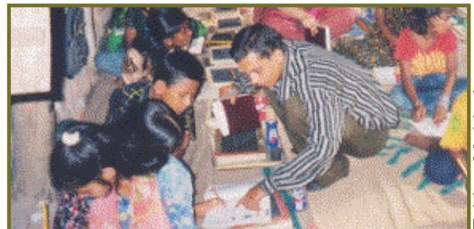
Picture above: The field officer [in-charge of a particular area] will often come for inspections. Here the field officer is helping the students with a math assignment.

A school's culture is reflected in the shared philosophy of those employed and enrolled. The culture of a school allows us to wholly understand its atmosphere - respect, belongingness, and support which are important for teachers, staff and students. Most children at the Tongi School felt that their school did have a positive culture, where the students and teachers shared a sense of belonging and respect. The following comments reveal some of their feelings.