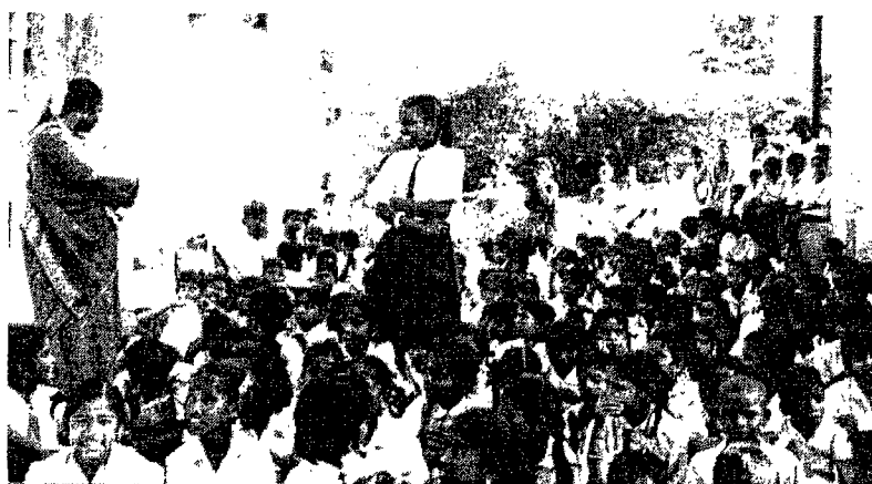
Primary School, Chennai

In general they wanted to work with more learners and parents to obtain their view of the school. They stressed the importance of the continuation of the work of the co-ordinating group to follow through all the issues that had arisen. They were putting a number of changes into practice and were planning further interventions. They have changed the way they conducted planning meetings to discuss the progress of learners and work for the following term. They used to have 'monolithic case conferences' but now they break up into smaller groups and there is much wider participation, in planning for lessons and in consultation about the development of the organisation. They have started to work with