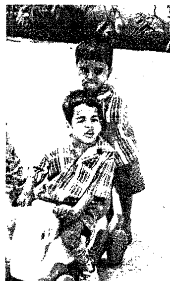
Pre-school, Colaba, Mumbai

The framework of the Index, the Dimensions and Sections, were seen to be relevant across all contexts. The reaction to the Indicators and Questions depended on the context. In the better resourced contexts, there were detailed comments on the Indicators and Questions. The suggested changes provide an important opportunity for detailed dialogue about differences in language, perspective and context between England, India and other countries, although there is only space here to discuss some of them. Within the economically poorest contexts many of the Questions were seen to be irrelevant and this highlighted the importance of working with the concepts and framework in a participatory way before moving on to the detail of the Indicators and Questions, if at all.