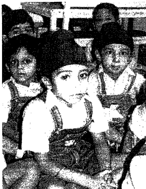
Private school, Mumbai

One group expressed particular concern about work that needed to be done on the preparedness of parents, staff and learners in the mainstream to include learners with impairments. In the English version of the Index, there is a Question about 'disability equality education' for staff, and there are 'Questions' about the responsiveness of