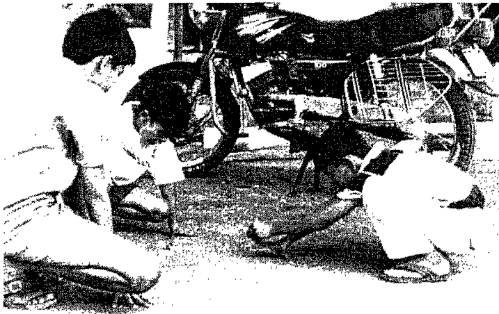
Boys playing in the street, Mumbai

Inclusion is about every aspect of work in a school. It's about every lesson. It's about teaching science. It's about children being together in the playground. It's about how people behave in staff meetings and how teachers work