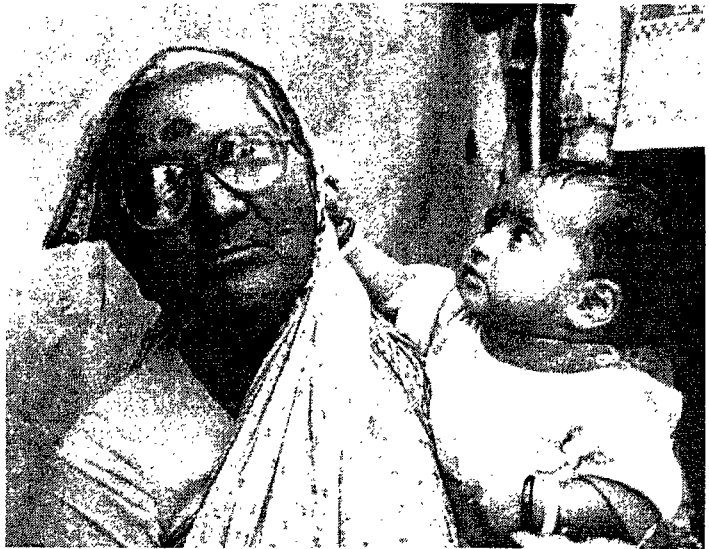
Older woman with child, Dharavi, Mumbai

Communities are poor and some are excluded from involvement by their distance from the school. Yet, the communities are a substantial resource for the school and supportive of it and the school had capitalised on this goodwill. The extended families help to make it possible for a degree of stability for learners whose parents are working in other parts of the country. However, in discussion it was pointed out that for many schools in South Africa there was little community involvement, and a legacy of distrust for State institutions. There was concern that the education learners receive should be related to the economic needs of their communities.