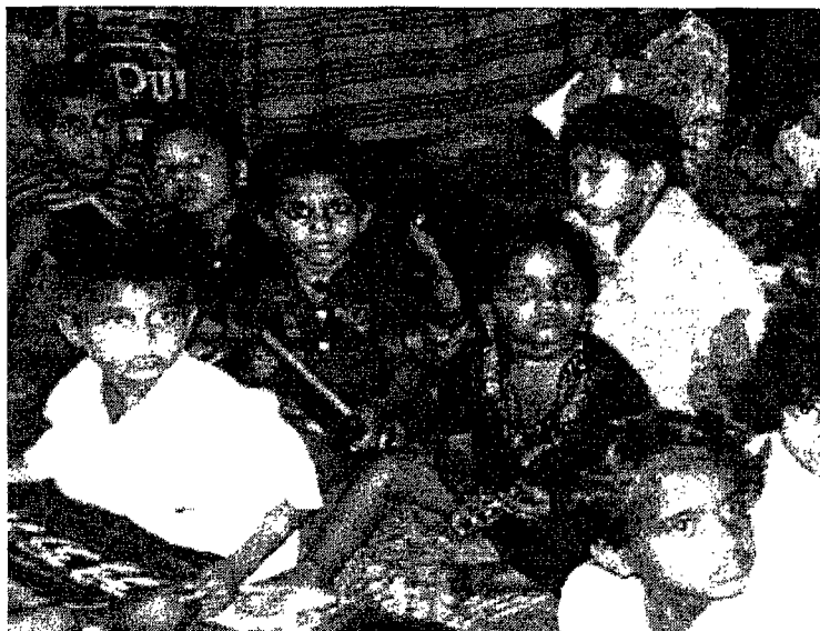
Pre-school in Dharavi, Mumbai

There are two distinct parts to the Index and one is a philosophical dimension and one of them is a content dimension. In India, if we start with the philosophy it is going to go across brilliantly. In my situation, in the city, it is a very strange phenomenon that the more deprived a school the more inclusive it is. Because the more exclusive a school is, in the sense of rich, the more exclusive it also becomes more generally. Which is why I thought the schools that were chosen in Bombay were brilliant