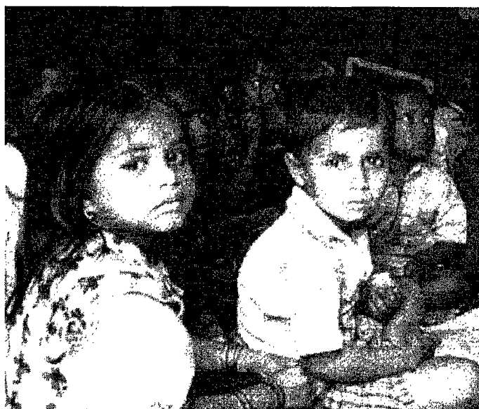
Pre-school, Dharavi, Mumbai

The cultural as well as economic distances between the communities attending a private learning centre in a city and those in impoverished circumstances in the rural areas may be so vast as to make it difficult to consider that they share a single education system that can be supported by a single Index. In these circumstances the priority in developing an Index must be to make it work for the poorest children. It must not be another means to increase the gap between the advantaged and disadvantaged.