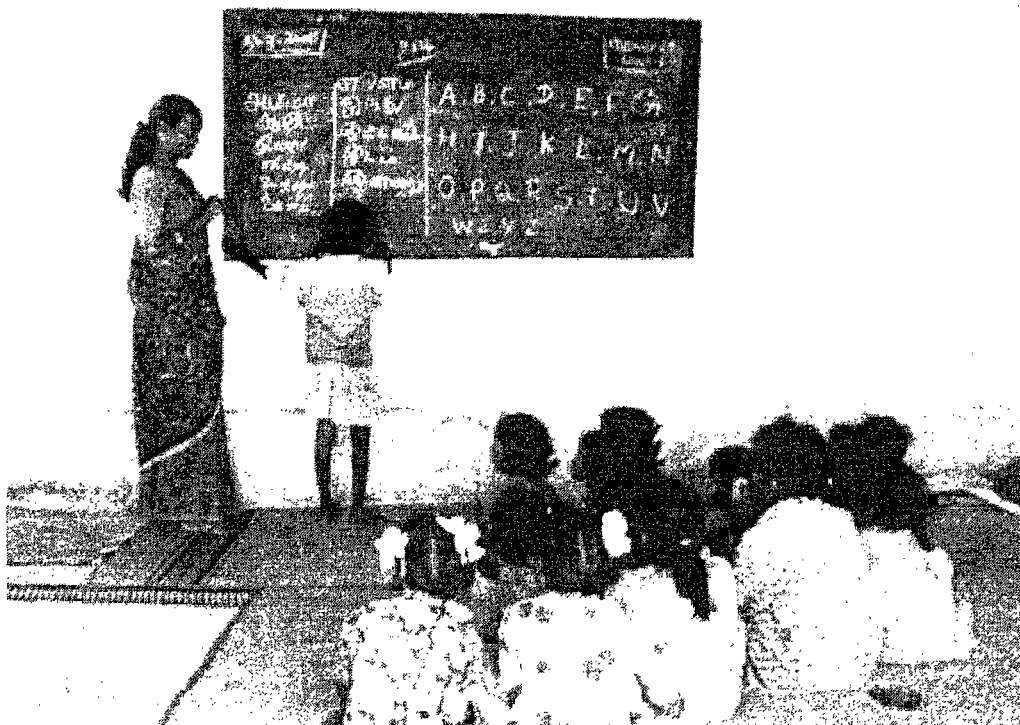
Pre-school outside of Chennai

It was clear that this was an important starting point for many learning centres, and might link to other areas such as the curriculum in the first phases of supporting the inclusive development of learning centres. In compiling the Questions it was felt that some would not apply in some contexts. Where learning arrangements are created to support the learning of nomadic learners, there may be flexible attendance at a learning centre which itself may move.