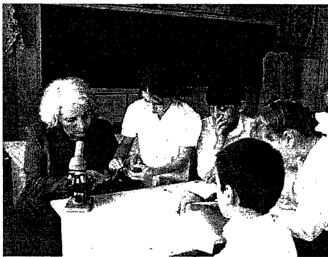
Primary school Bucharest, Romania

In Romania schools are beginning to work on the Index ... teachers are beginning to open up ... trying to look to involve the inspectors to give pedagogical support rather than just checking up... In each school one person was chosen to be a 'critical friend'. One school had chosen a young woman who was a PhD student and had the professional background to be able to give support but was also a non-threatening figure for the teachers. The schools all chose three Indicators that they wanted to work on. They decided on questions for the parents and the children and for the teachers. And after that process it was surprising for the teachers that when – for example, 'Are