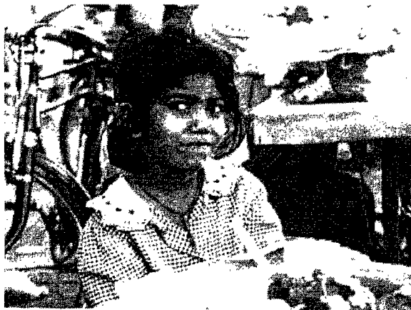
Girl helping out the parents in the market, Mumbai