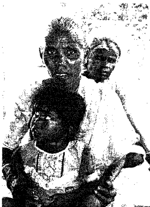
Women from the local community assisting the pre-school teacher, Chennai, India

Support is given a broad meaning as 'all activities which increase the capacity of schools to respond to the diversity of their learners'. Support is commonly seen as occurring when a learner is directly supported by an adult or more rarely another learner. In the Index such direct human support is seen as equivalent to curriculum or teacher development, or ways of organising classrooms which reduce the experience of educational difficulties.