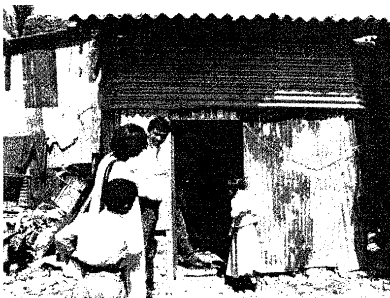
Pre-school in Dharavi, Mumbai

When we were asking the Questions [associated with this Indicator] the principal was listening for some time and then he had a very sad expression and then he said, 'Please I don't want to go ahead'. We asked why. He said, 'I don't have the infrastructure, I don't have the resources to give them these facilities and just reading them makes me feel even worse.