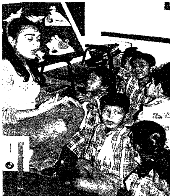
Pre-school in Mumbai

The Index builds on the sharing of existing knowledge about the school, of staff, learners, parents/carers and other community members about the barriers to learning and participation and resources to support learning and participation in their school. Before looking at the Indicators and questions, this knowledge can be structured using the Key Concepts and the Review Framework. The following questions can help in this task: